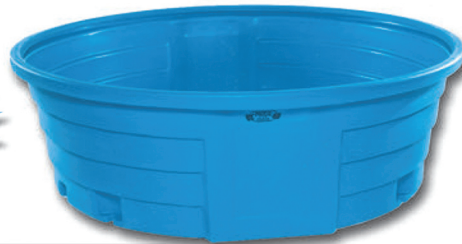
Model PR62: 400 Gallons

Models with factory installed Small Animal Drinker, SAND10. SAND10 can be installed on Models PRE224, PRE226 and PR62.