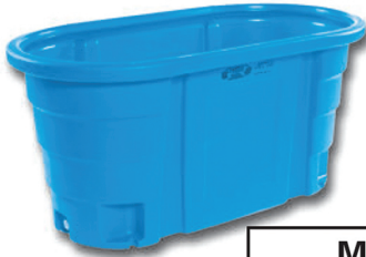
Model PRE224: 95 Gallons