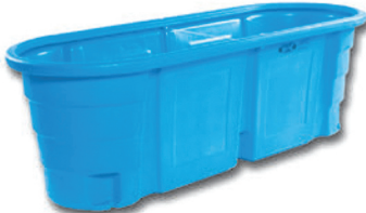
Model PRE226: 150 Gallons